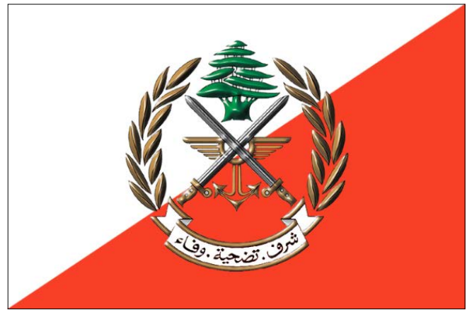
Figure 1: Flag and motto of the Lebanese army: "Honour, Sacrifice, Loyalty"

The bloody Nahr el-Bared campaign started a new and worrying trend: turning the Army into a political target. In late 2007, the army commander in charge of the siege of the camp was killed by a car bomb, followed soon after by twin bus bombs killing army personnel. The deadly attacks made the army start commemorating slain soldiers and officers as martyrs ( shabeed ). This is a martyrology, common in Lebanon, which posterises and commemorates victims in annual memorials and vigils. Unlike the country's numerous confessional martyrs, memorials of slain army soldiers portray them as martyrs of the nation, hence validates the army's motto of honour, sacrifice and loyalty to the nation (Figure 1).